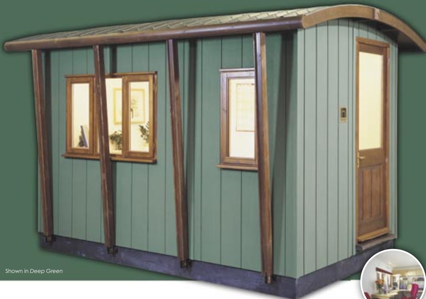
Shown in Deep Green