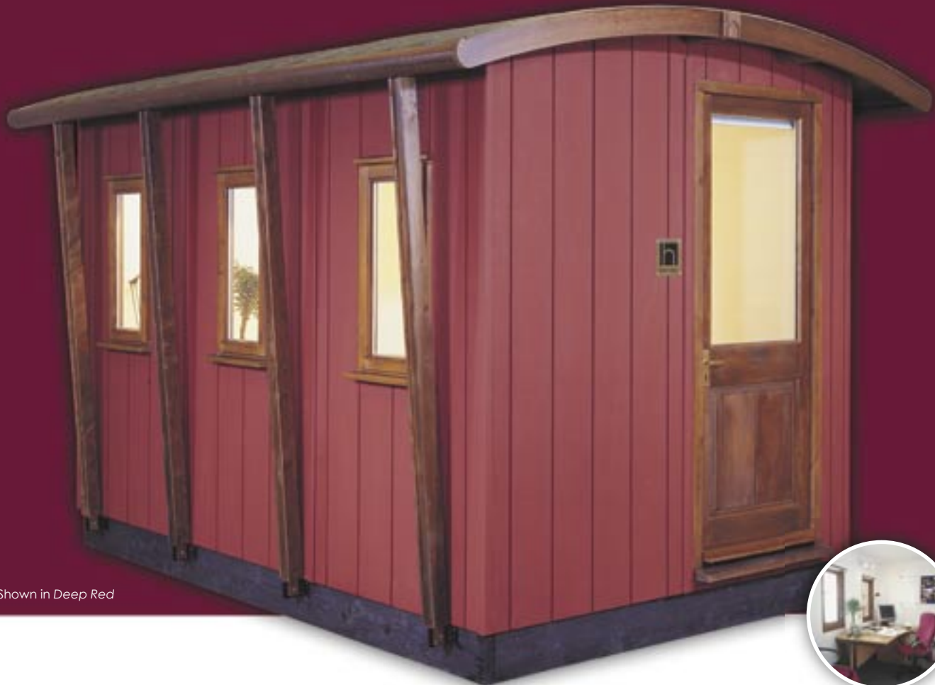
Shown in Deep Red