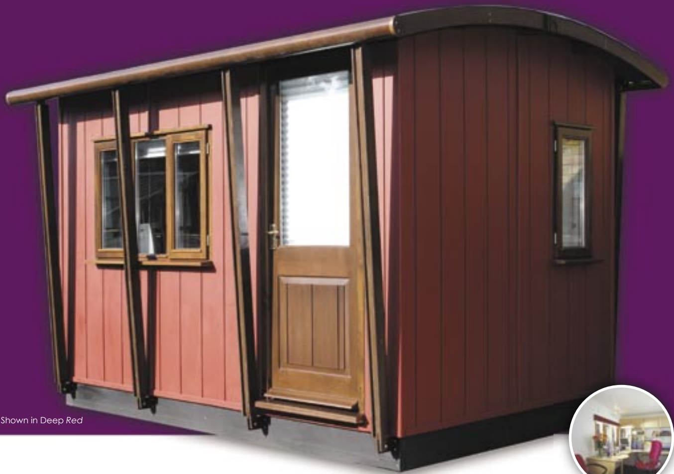
Shown in Deep Red