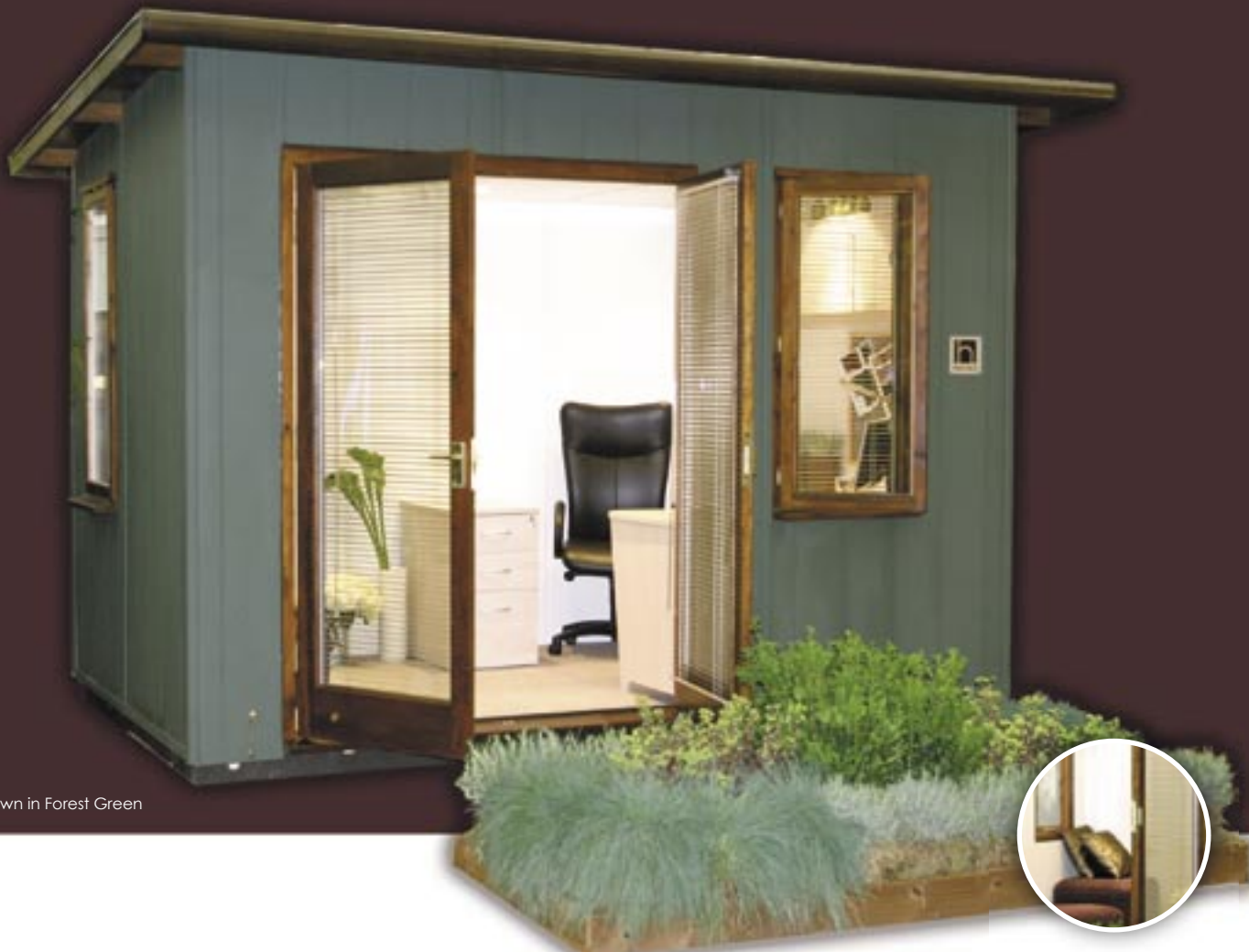
Shown in Forest Green